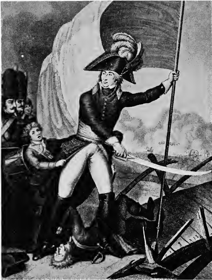
CHARLES PIERRE AUGEREAU, DUKE OF CASTIGLIONE FROM AN ENGRAVING BY RUOTTE